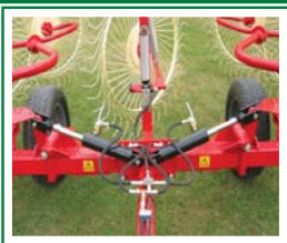
Hyd. Kicker Wheel

The 10 Wheel rake is designed with a front mounting fingerwheel to allow it to quickly swivel out of the way when only an 8 wheel is needed.