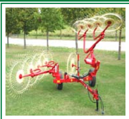
Single side raking feature